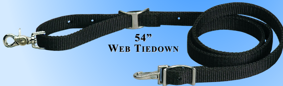
54" WEB TIEDOWN

Heavy 3/4" double and stitched web tiedown. 54" long with easily adjustable conway. Nickel plated spring snap on one end. Holes are treated to discourage fraying. Available in blue, brown and red.