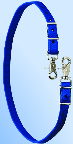
DOUBLE & STITCHED 34" WEB TIEDOWN

Heavy 3/4" double and stitched web tiedown. 34" long with easily adjustable conway. A nickel plated spring snap on one end and a rein snap on the other. Available in blue, brown and red.