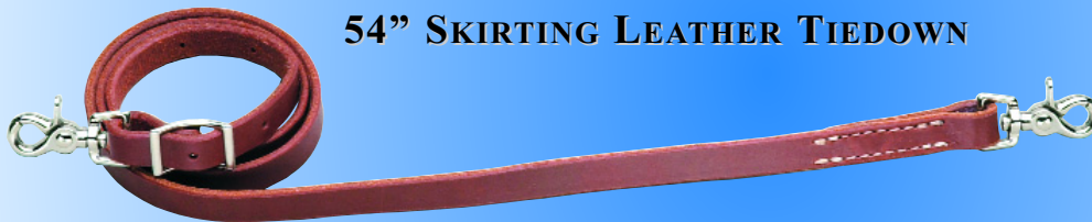
54" SKIRTING LEATHER TIEDOWN

Heavy 3/4" oiled and polished single ply skirting leather tiedown. 54" long with easily adjustable conway and a nickel plated rein snap.