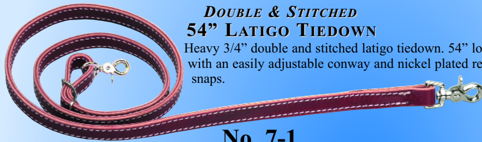
DOUBLE & STITCHED 54" LATIGO TIEDOWN

Heavy 3/4" double and stitched latigo tiedown. 54" long with an easily adjustable conway and nickel plated rein snaps.