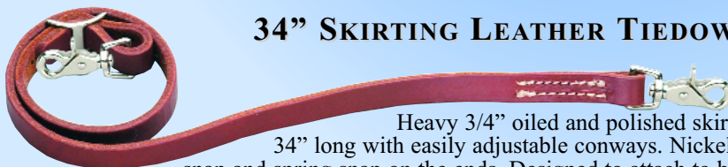
34" SKIRTING LEATHER TIEDOWN

Heavy 3/4" oiled and polished skirting tiedown. 34" long with easily adjustable conways. Nickel plated rein snap and spring snap on the ends. Designed to attach to breast collar.