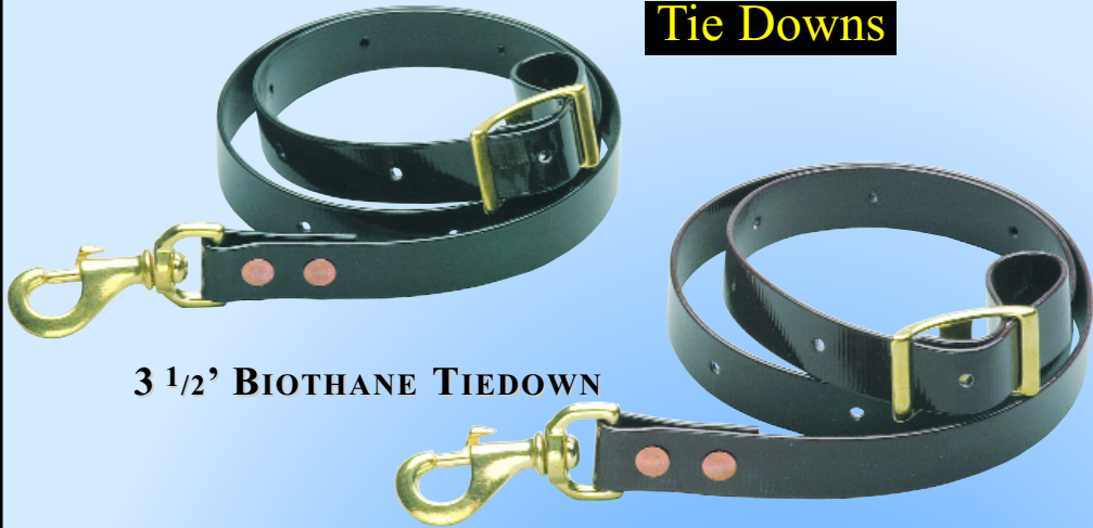
3 1/2' BIOTHANE TIEDOWN

Heavy 1" biothane tiedown, hand riveted with brass conway buckle and snap. Available in black and brown.