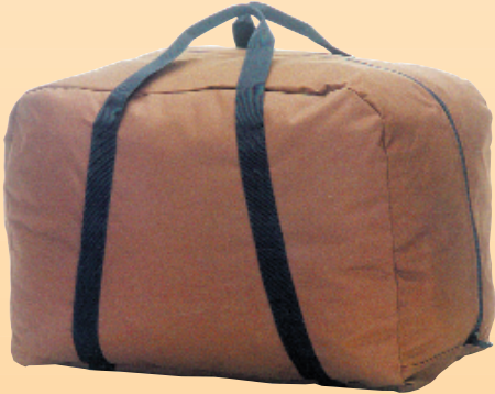
High quality cordura. Securely bound and reinforced with heavy webbing. Heavy full length zipper. Heavy web carrying straps extend completely around bag. 29" Long • 14" Wide • 20" High No. 14-24