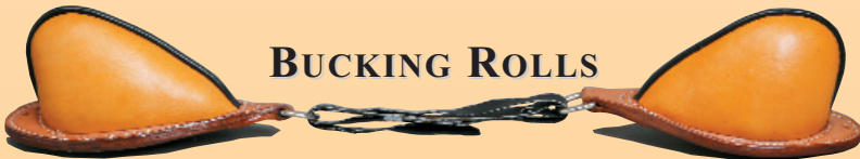
High quality leather rolls. Easy to attach. Gives any "A" fork saddle a distinctive look. No. 1-12