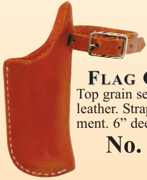
FLAG CARRIER Top grain selected russet leather. Strap for adjustment. 6" deep pole pocket. No. 14-50