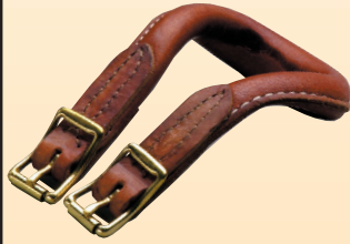
CRUPPER Sewn leather crupper stuffed with flax seed for smooth shape. Brass buckles sewn onto crupper. No. 9-71